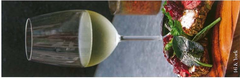
16 & York