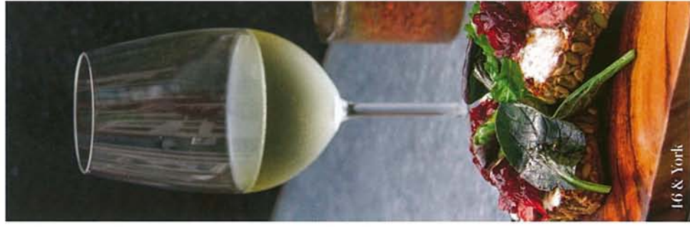
16 & York